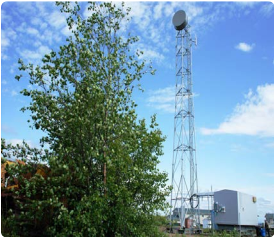
A Telecommunications tower was funded by USDA Rural Development's Rural Utilities Service in New Stuyahok, Alaska.

Communities in Bristol Bay and the Yukon-Kuskokwim Delta in Southwestern Alaska didn't have access to broadband due to their extremely remote location, and the icy, difficult terrain. However, USDA Rural Development was able to help. Broadband Initiatives Program loan and grant funding connected 65 communities in southwestern Alaska through a project spanning 75,000 square miles – an area about the size of Oregon. The network, dubbed "TERRA-SW," uses undersea fiber, terrestrial fiber, and microwave links to provide connectivity. The project brought broadband to these communities for the first time.