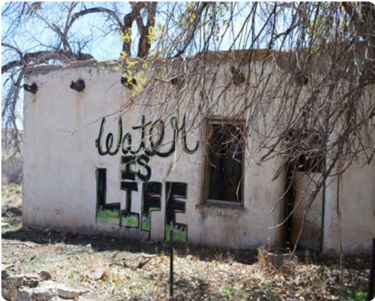
A tree struggles to survive outside an abandoned trading post bearing a prophetic message near St. Michaels on the Navajo Nation.

It's said that no one pays attention to water until the well is dry. Native American Tribes have been paying attention for quite some time now.