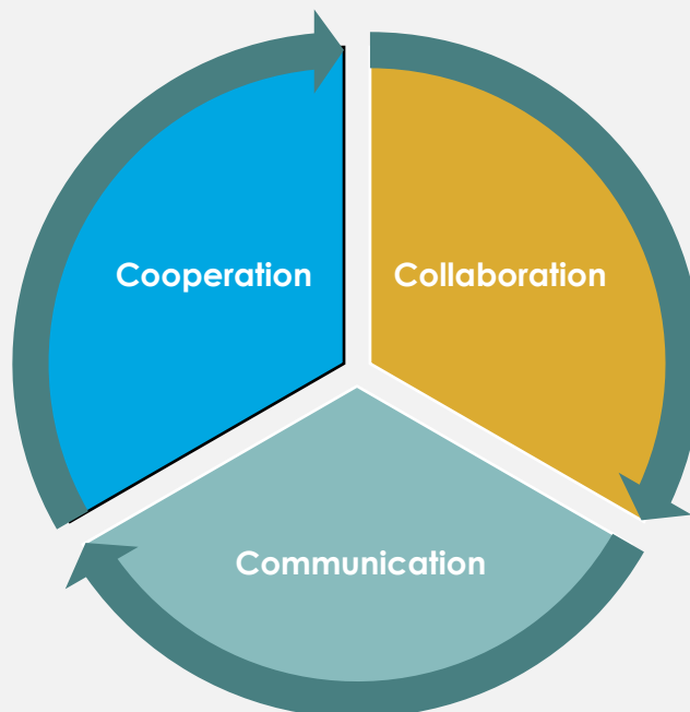
Figure 1: MDT Practices for Effective Change

MDTs work toward effectual and impactful services for a target audience through: